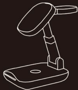
4-in-1 Wireless Charging Station