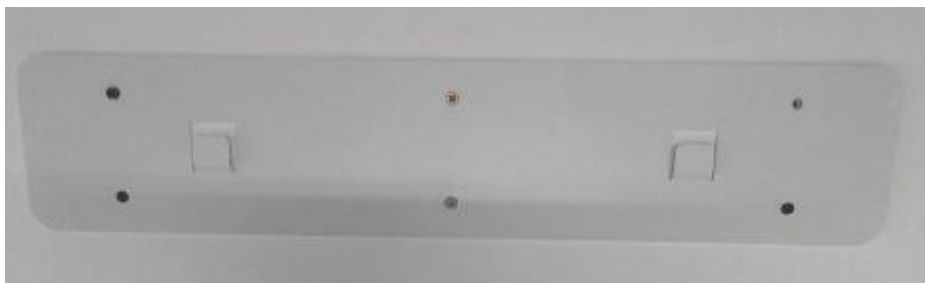
Fixed on the wall