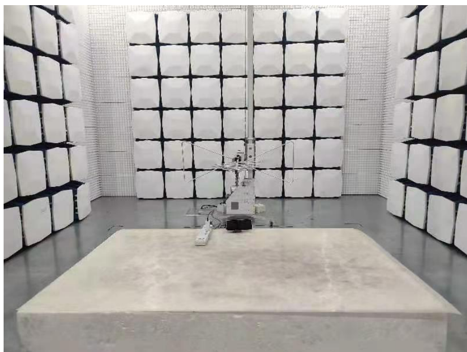
Radiated Measurement Photos