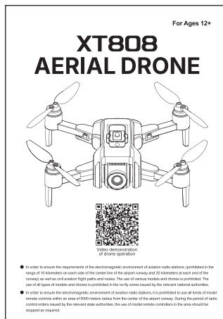
Instruction manual X1