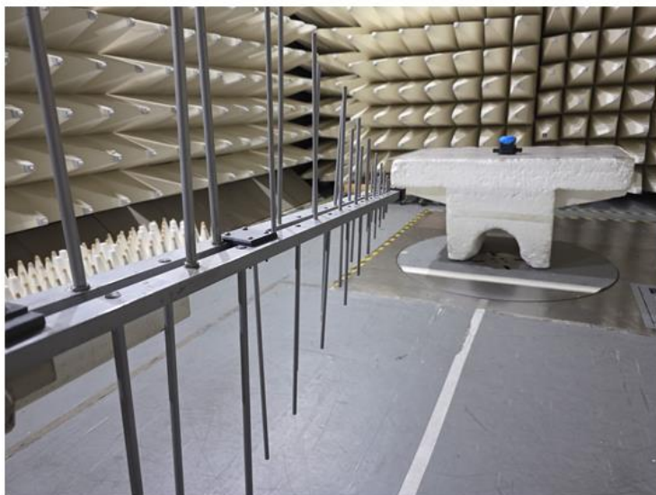
Photograph No.2 Setup for spurious emission field strength measurements in the anechoic chamber above 1000 MHz for Allegro Cellular