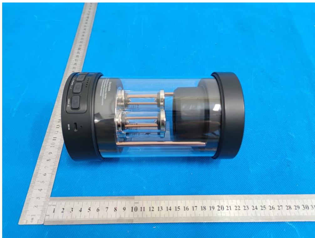
PORT VIEW OF EUT (FIGURE 1)