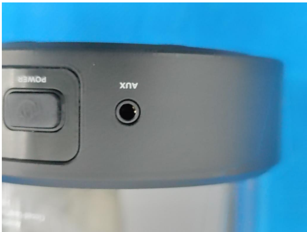
ADAPTER VIEW OF EUT