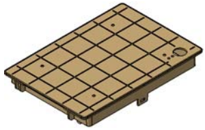
Wireless charger Unit