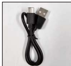
USB cable (USB to Type-c)