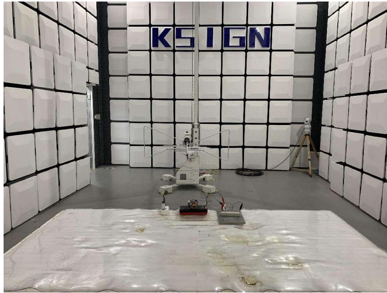
Radiated Emissions 9K-30MHz