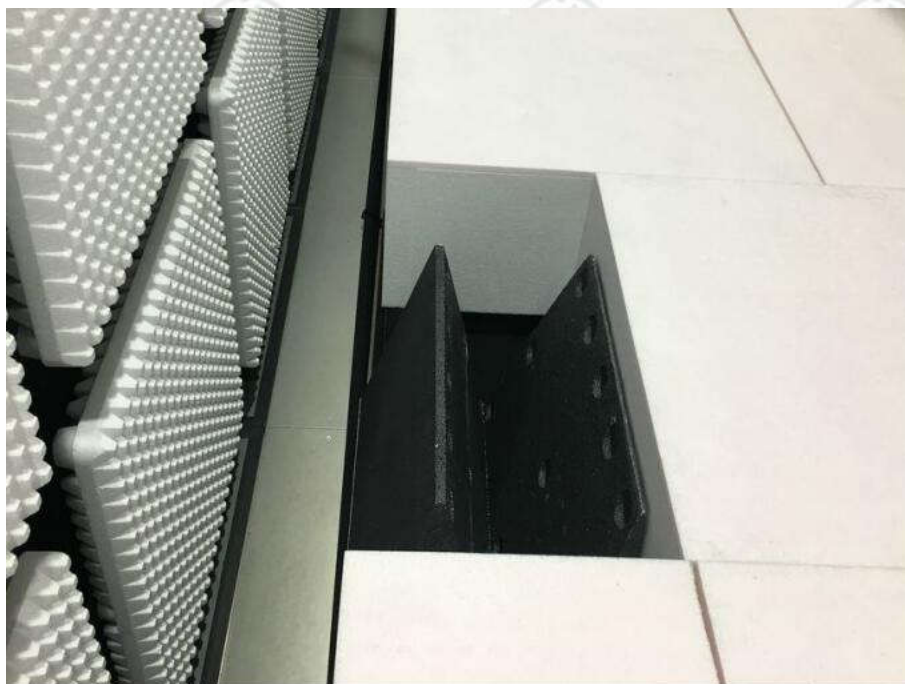
Radiated spurious emission Test Setup-3(Above 1GHz) There are absorbing materials under the ground.