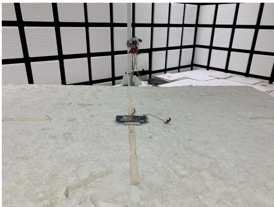
Radiated spurious emission Test Setup-2(Above 1GHz)