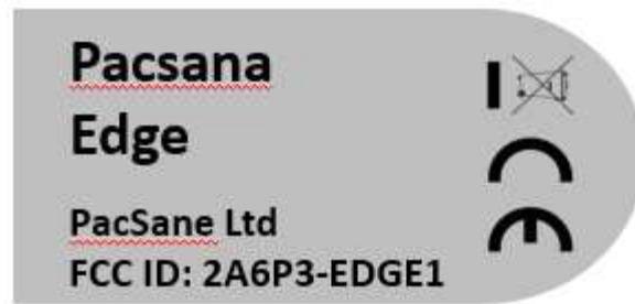
Figure 2: Draft of the packaging label design.

The label will be engraved into the device plastics to ensure that it is readable throughout the device lifetime.