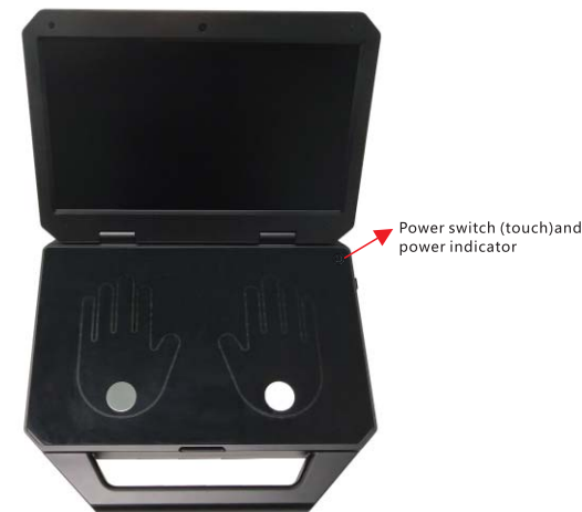
Power switch (touch) and power indicator

⑨If the machine is not in use, press the power switch for 2 seconds to turn off the machine.