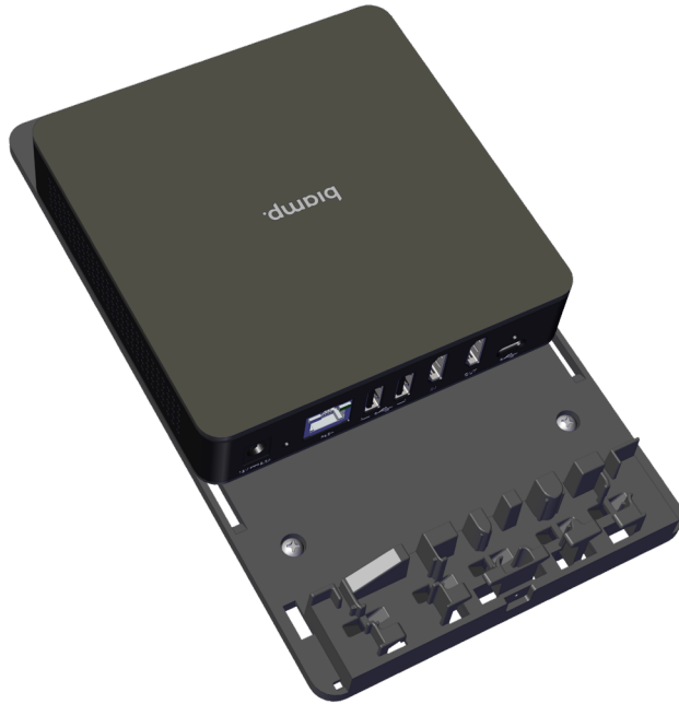
Figure 1. Modena Node X 100 and Hub X 100 with Bracket

A wall-mount bracket comes installed on the device and may easily be removed. The following hardware is included for mounting the Node/Hub with the attached bracket.