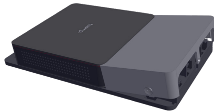
Figure 6. - Node and Hub with cables and management tray