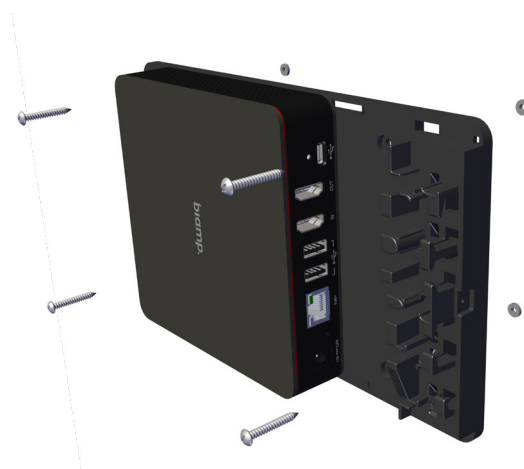
Figure 3. - Wall installation