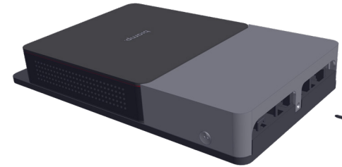
Figure 7. Secure cover