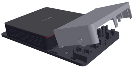
Figure 5. - Node and Hub tray cover