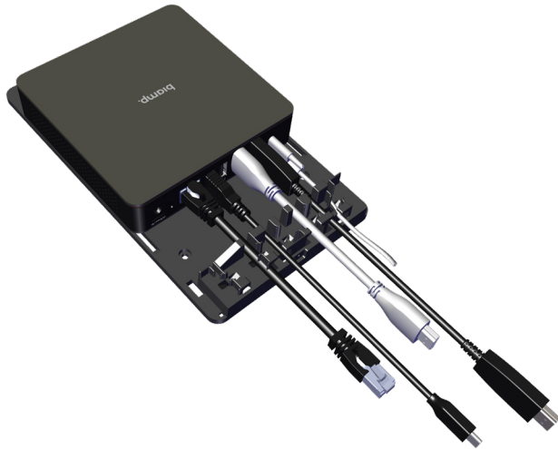
Figure 4. - Node and Hub with cables and management tray