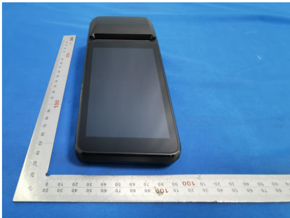
FRONT VIEW OF EUT