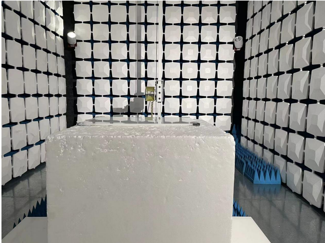
Conducted emission test setup