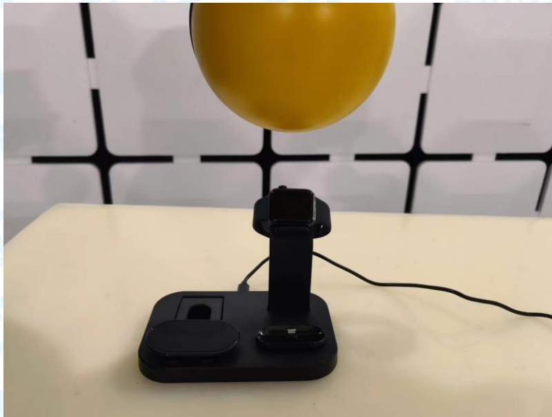
Test Set-up Photo