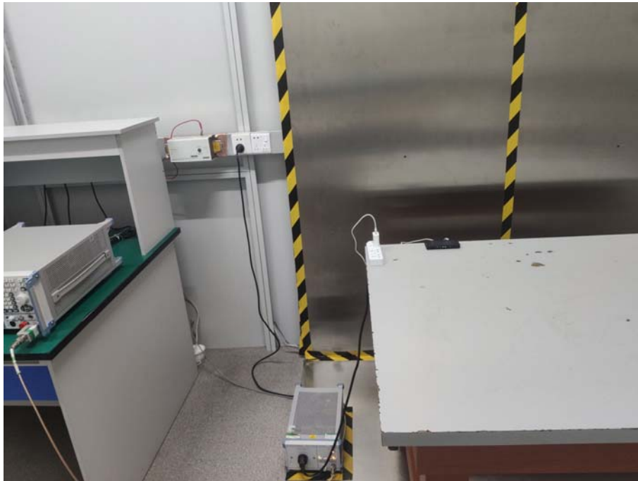
RF Conducted Emission