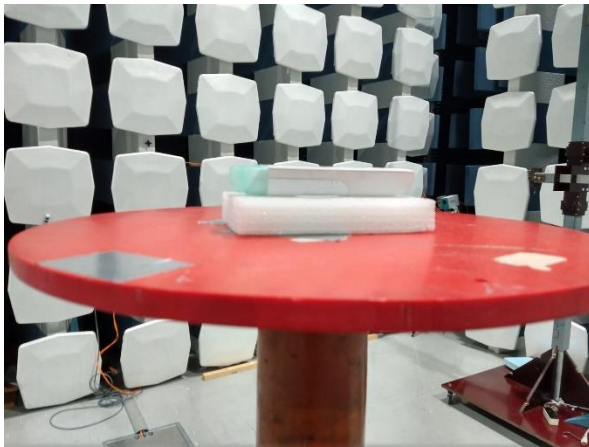
Radiated Emissions XY plane