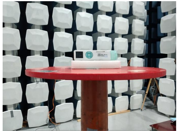
Radiated Emissions XZ plane