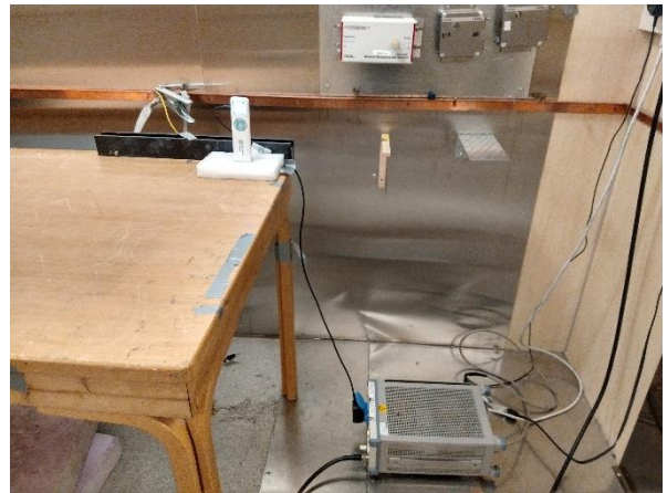
Power-Line Conducted Emissions