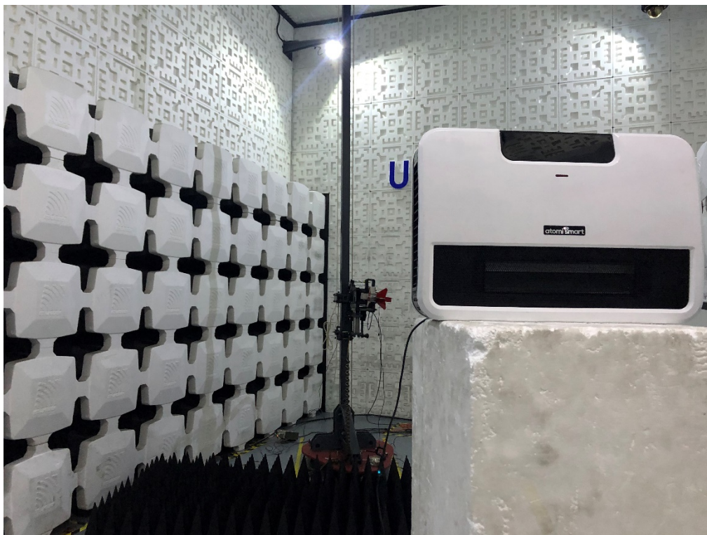
Radiated emission Test Setup (Above 1 GHz)