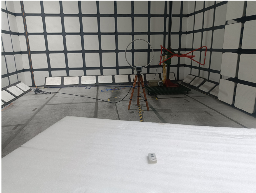
Radiated Emissions View (30 MHz- 1 GHz)