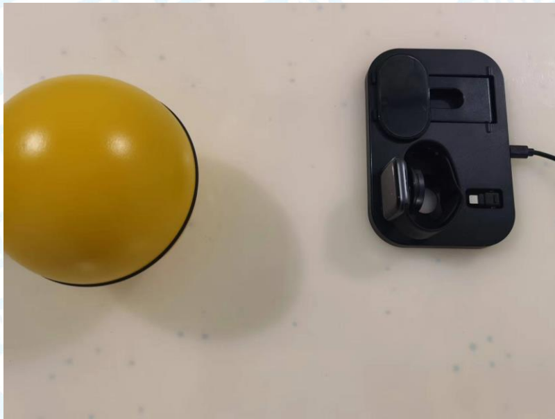
Test Set-up Photo