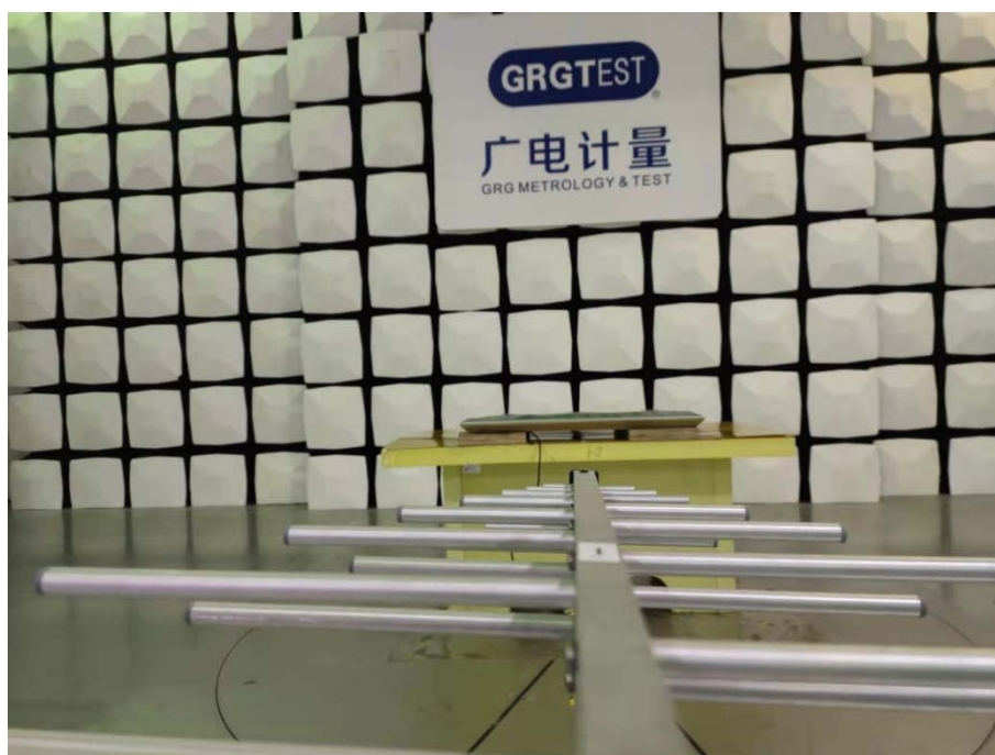
30MHz ~ 1GHz