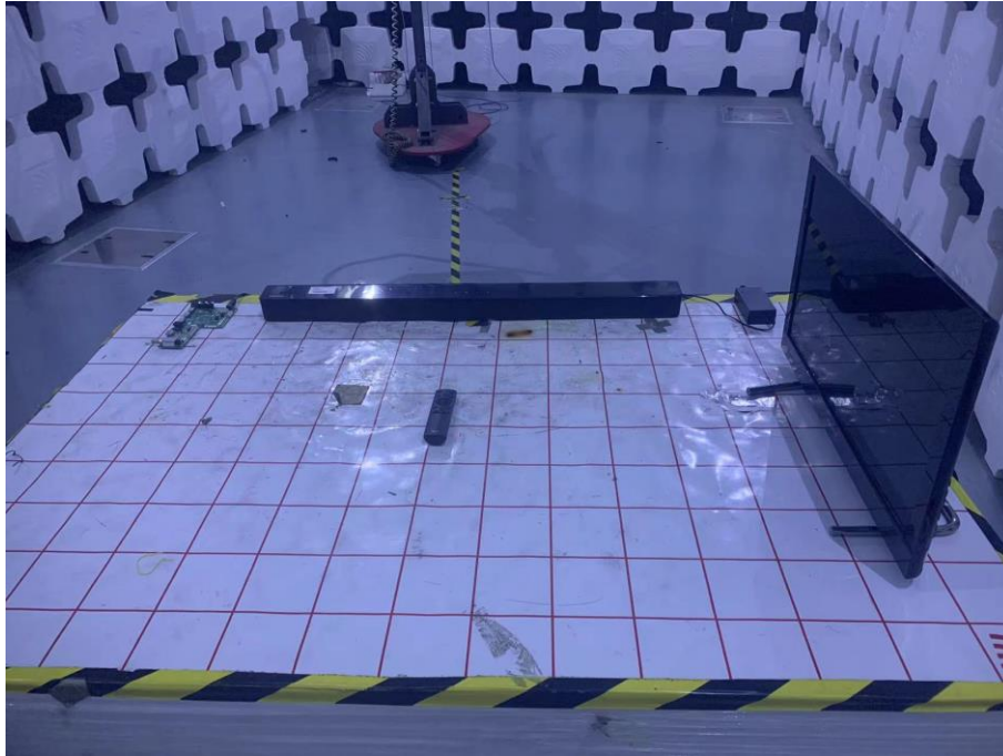
Back View (Below 1GHz)