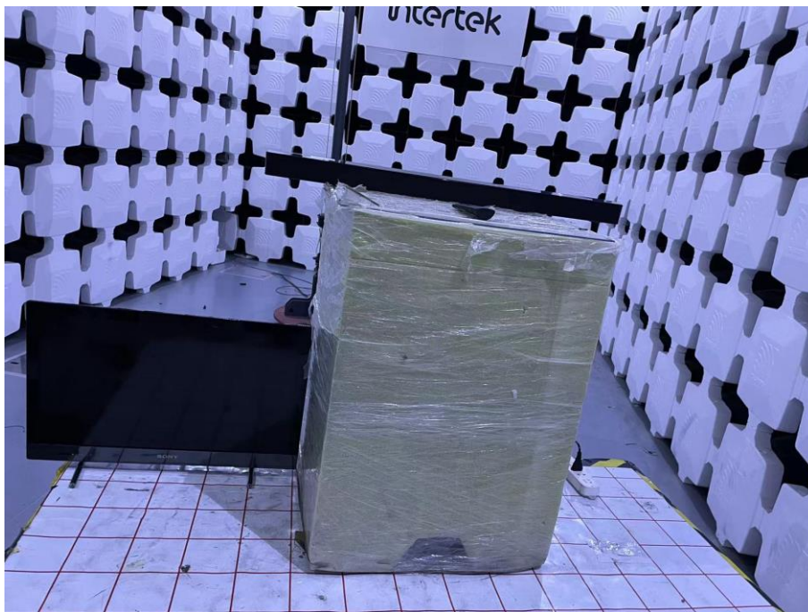
Back View (Above 1GHz)