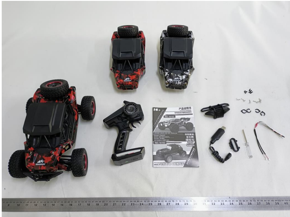
ALL VIEW OF EUT-16