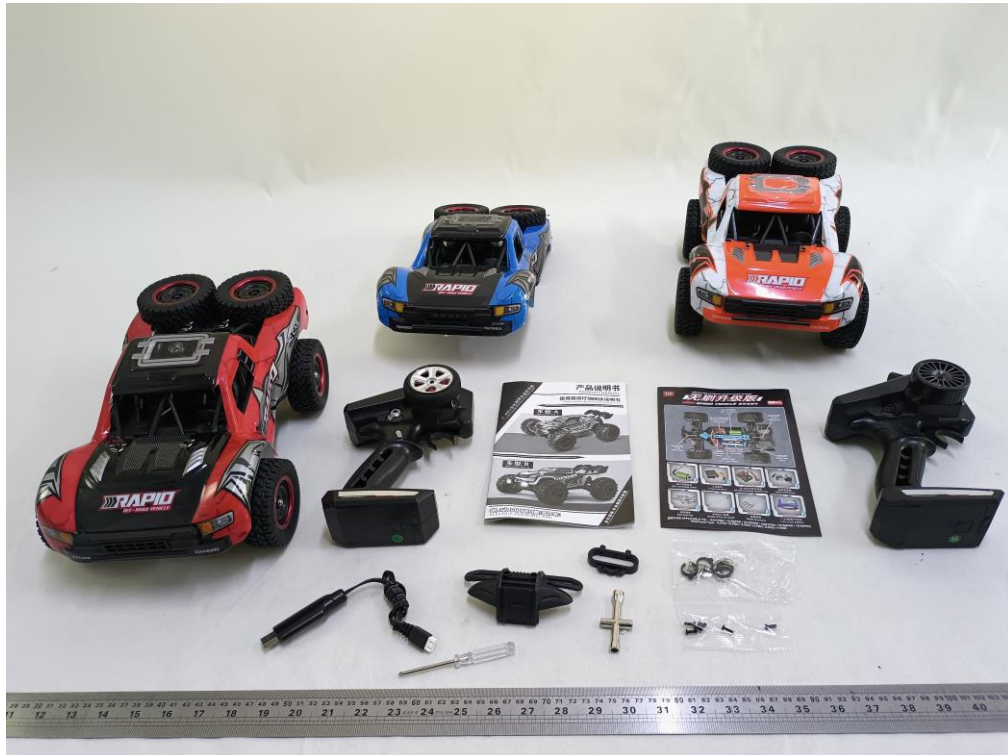
ALL VIEW OF EUT-14