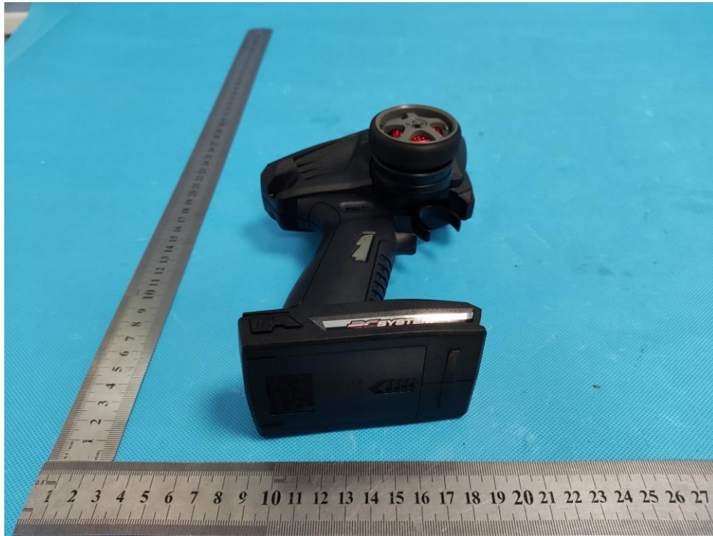
FRONT VIEW OF EUT