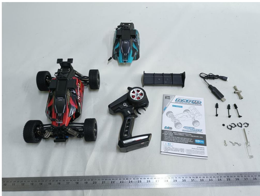
ALL VIEW OF EUT-6