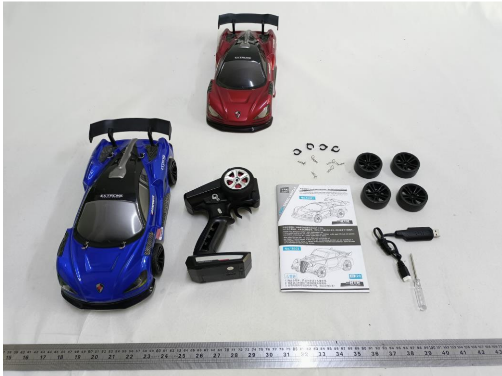
ALL VIEW OF EUT-18