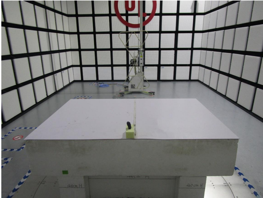
Radiated Disturbance Setup Below 30 MHz