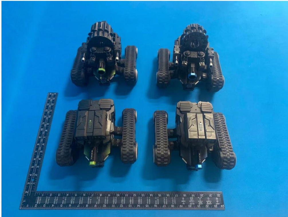
ALL VIEW OF EUT-6