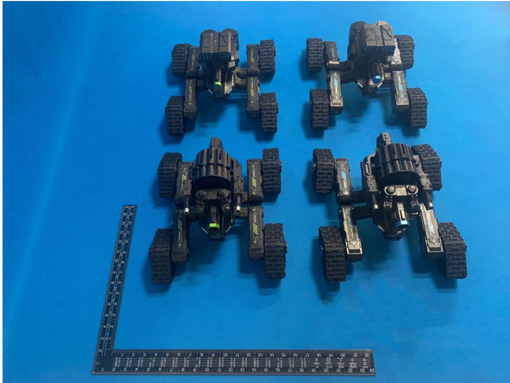
ALL VIEW OF EUT-4