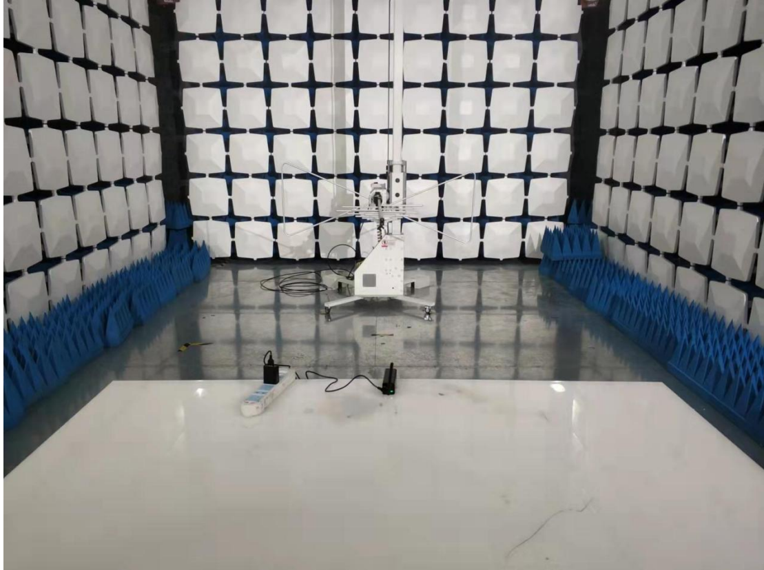
Above 1GHz for radiated emission test setup