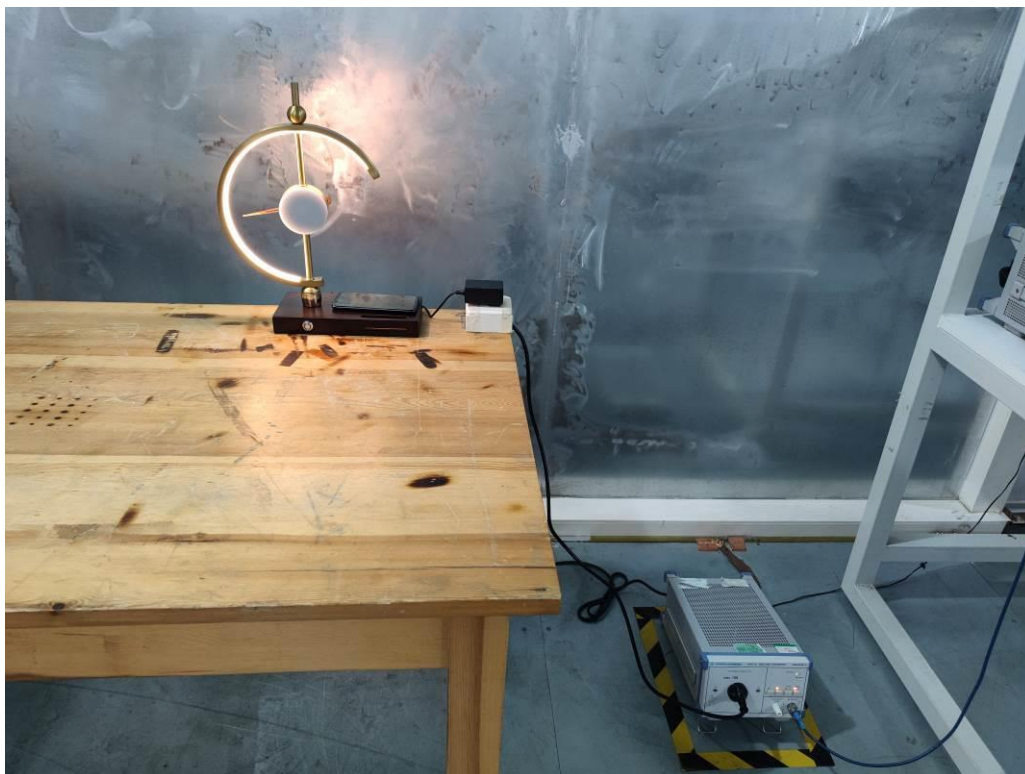
Conducted Emission-AC adapter charge mode