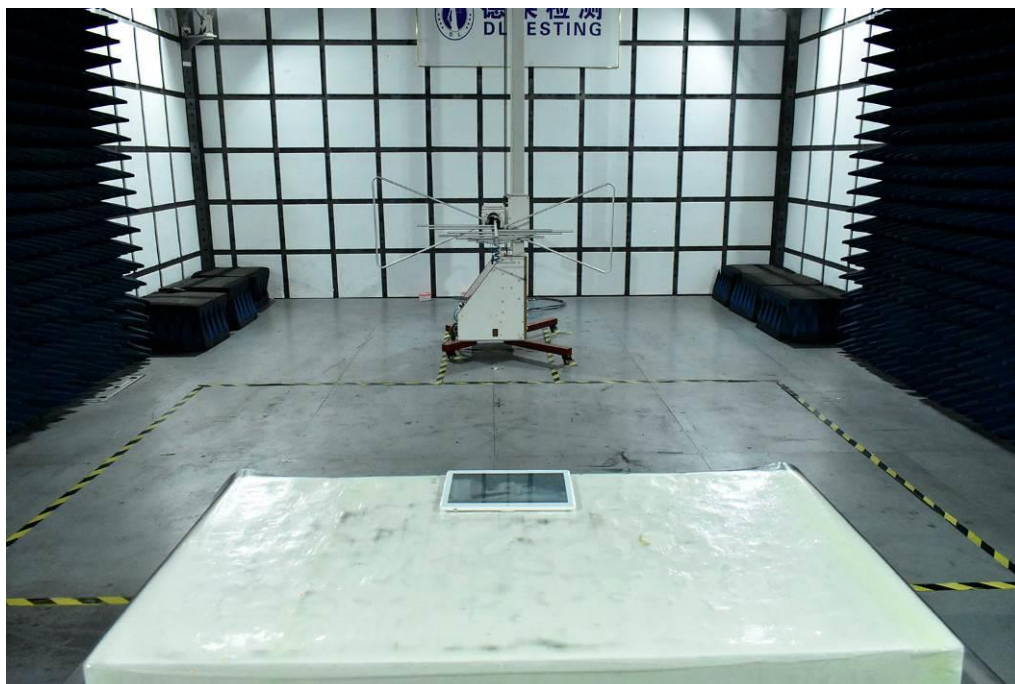
Radiated Measurement Photos