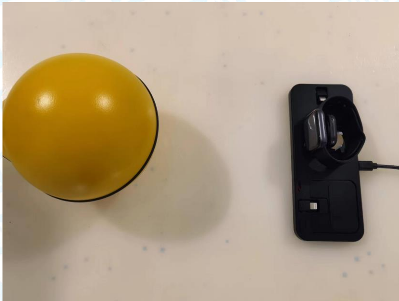
Test Set-up Photo