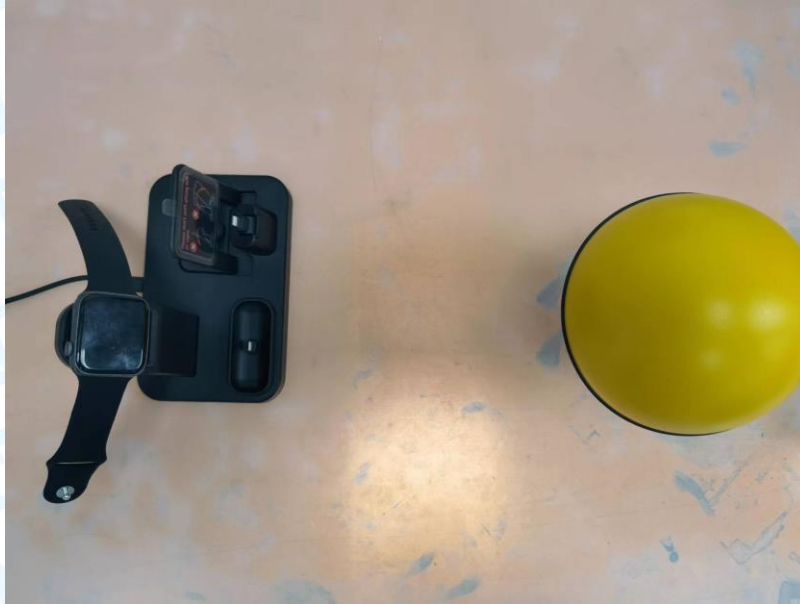
Test Set-up Photo