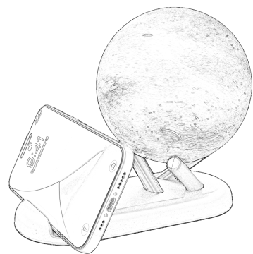
Ambient Mood Lamp Speaker

Packaging accessories: speaker * 1, instruction manual * 1, bracket * 3, base * 1, charging cable * 1,Remote control * 1