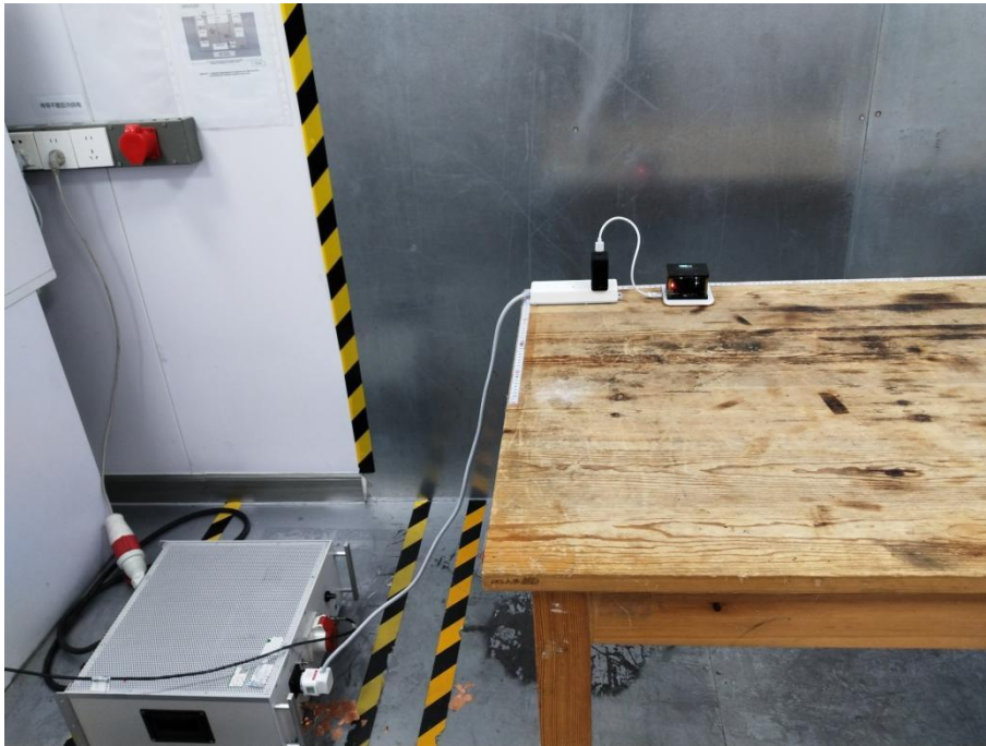
Emissions in frequency bands (below 30MHz)