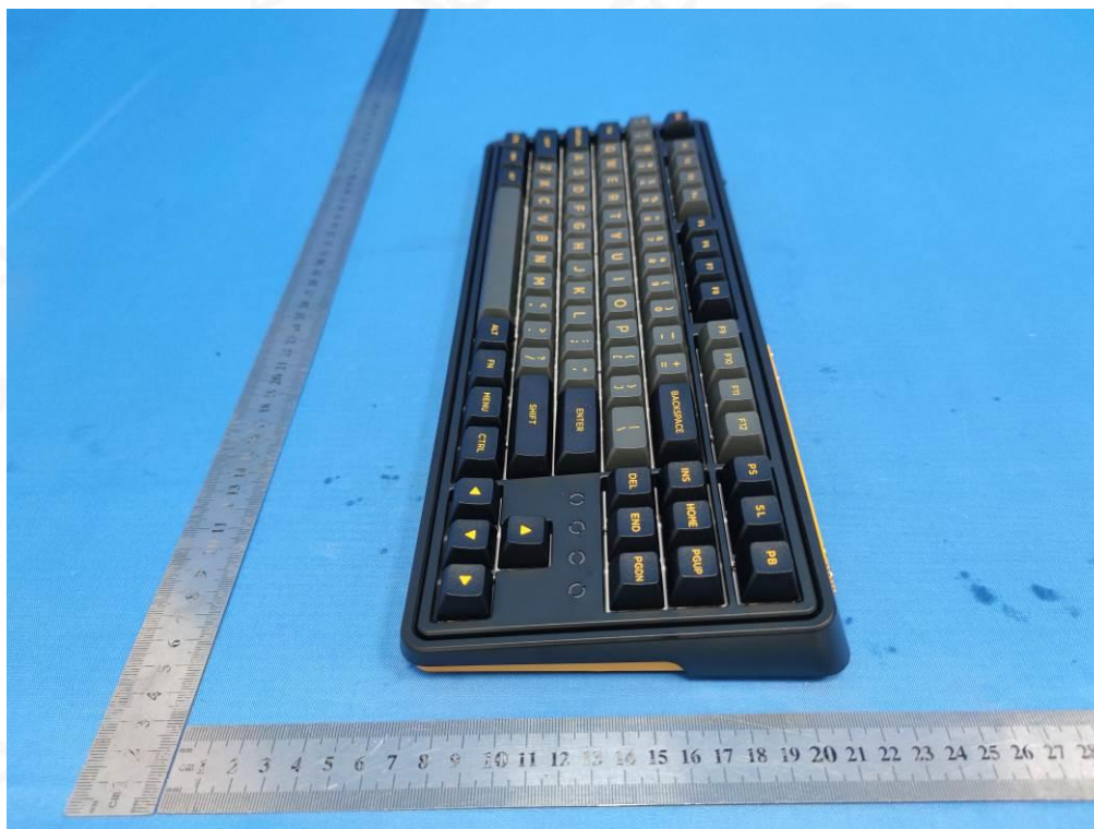
PORT VIEW OF EUT