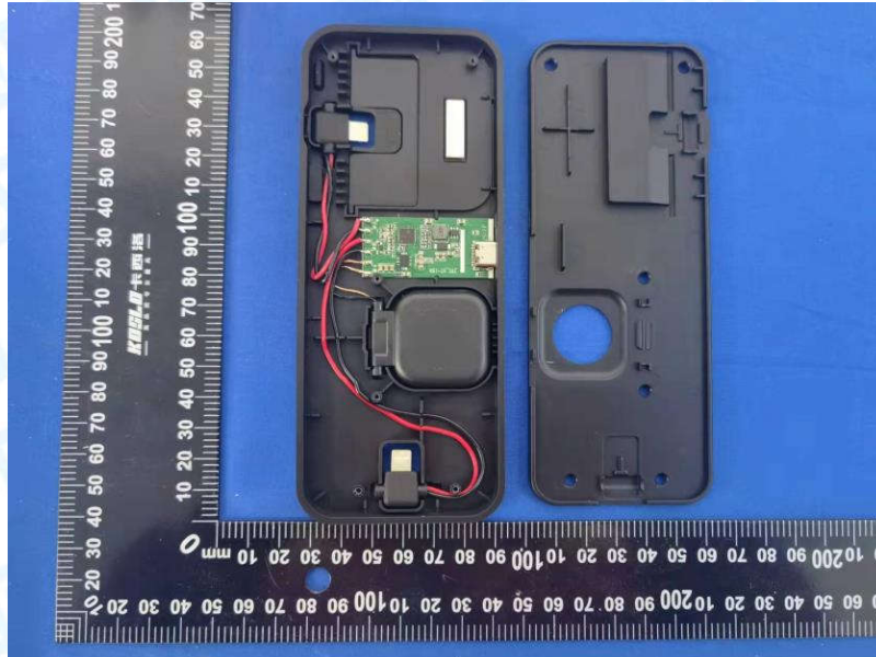
Photo 10 Appearance of PCB