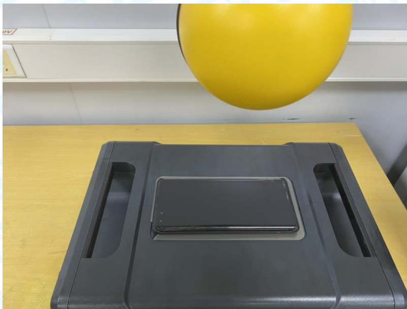
Test Set-up Photo