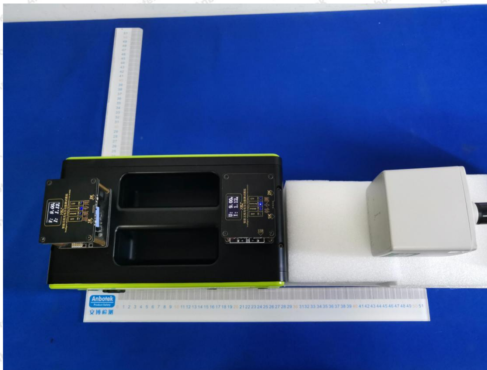
Photo of MPE Measurement