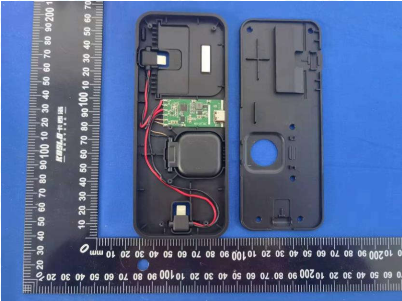
Photo 10 Appearance of PCB