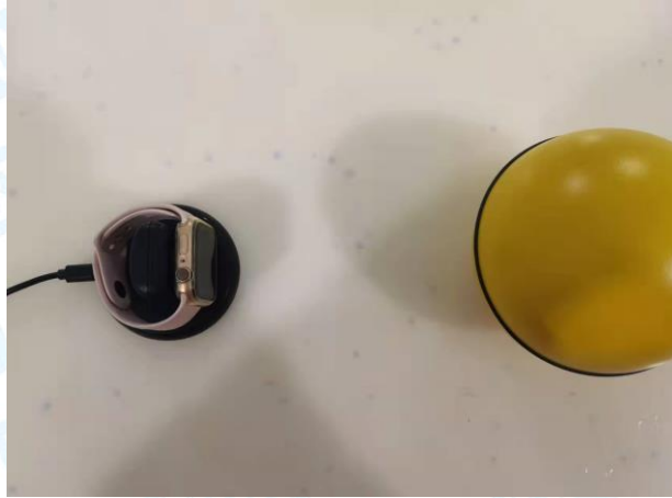
Test Set-up Photo