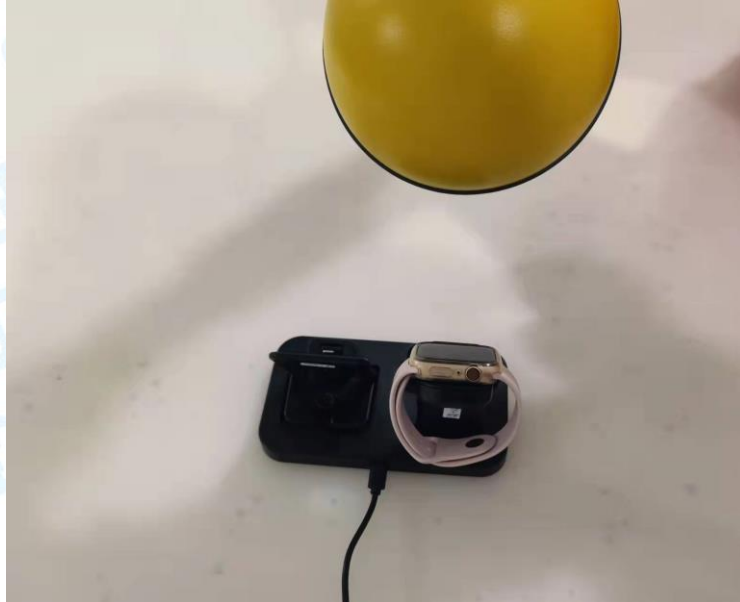
Test Set-up Photo