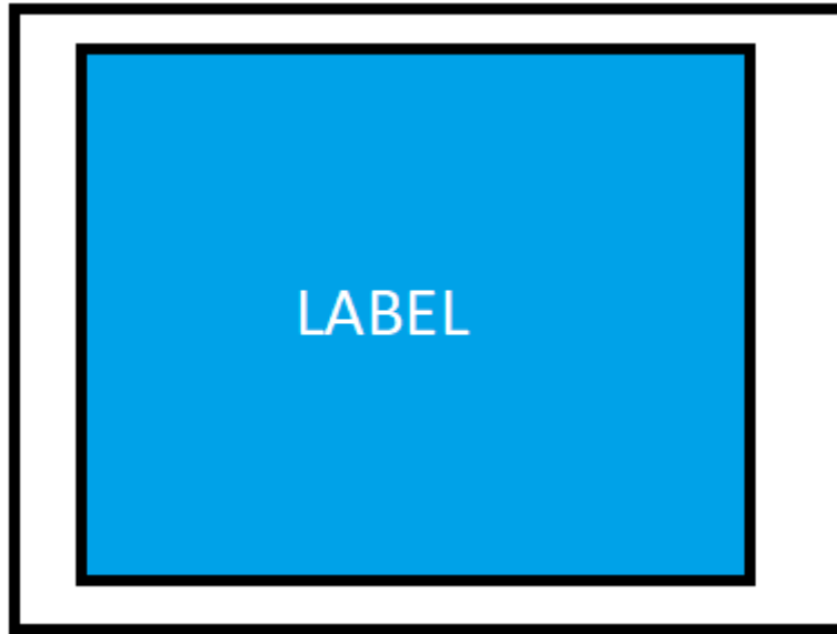
Figure 1 – Label position, on top of Module

www.ilinemicsystems.com info@ilinemicsystems.com Tel. +34 943 005 651 Fax: +34 943 008 737