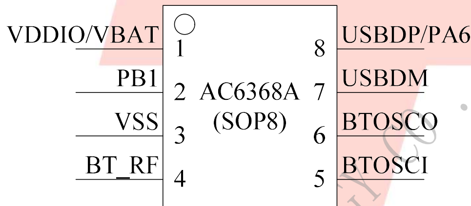
Figure 1-1 AC6368A Package Diagram