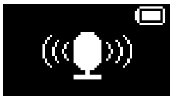
Recording status display