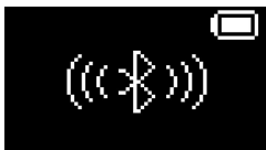
Bluetooth pending connection status display