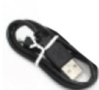
USB Cable (for Receiver&Transmitter)