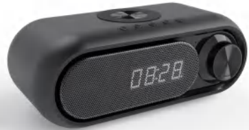
WD-300 Wireless Charge Clock Speaker