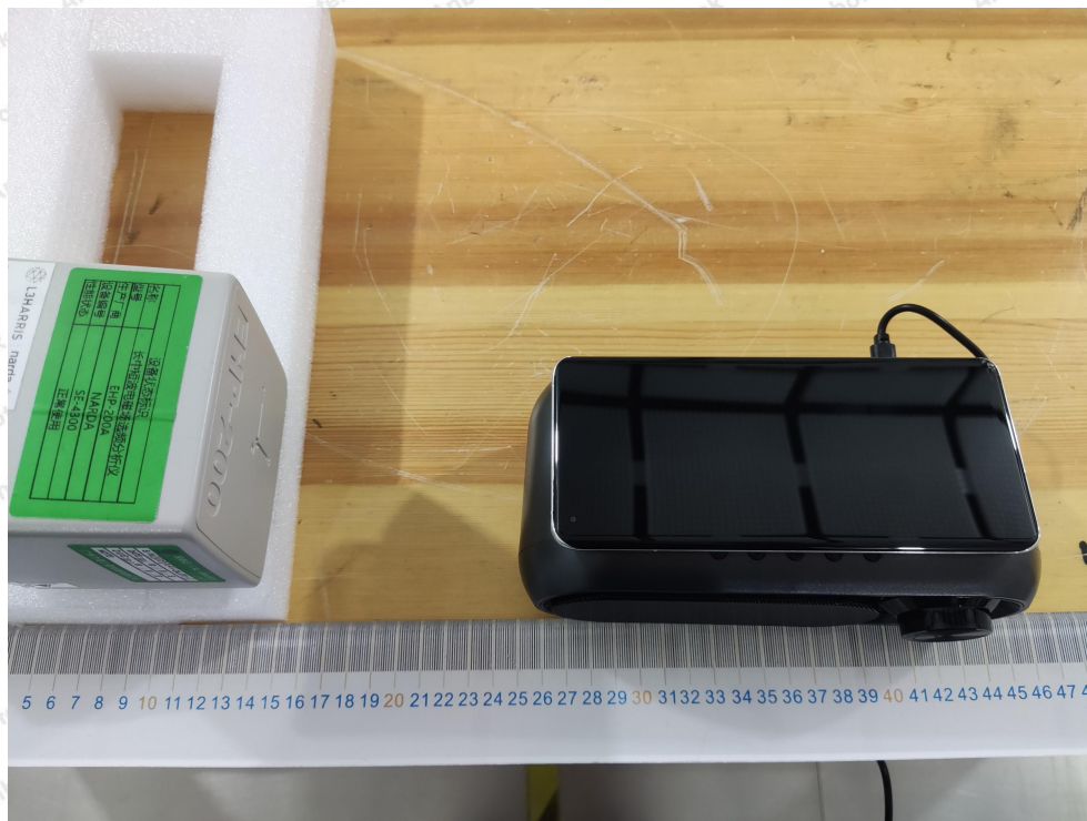
Photo of MPE Measurement