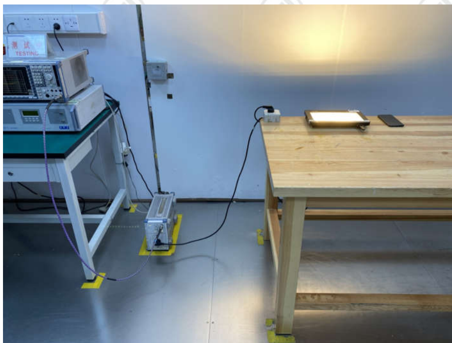
AC Power Line Conducted Emission Test Setup