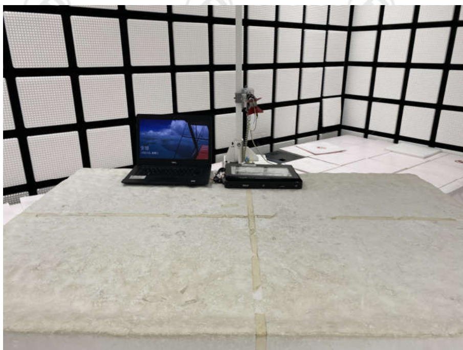
Radiated spurious emission Test Setup-2(Above 1GHz)