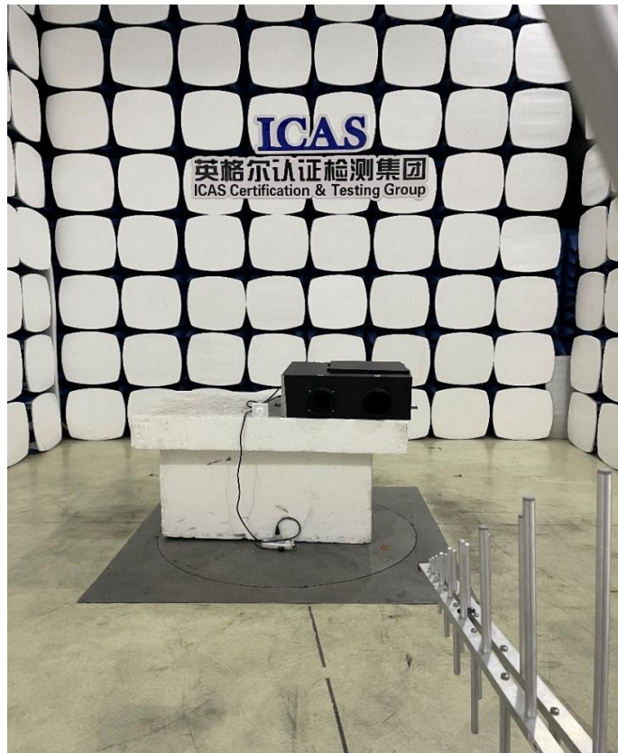
Below 1 GHz