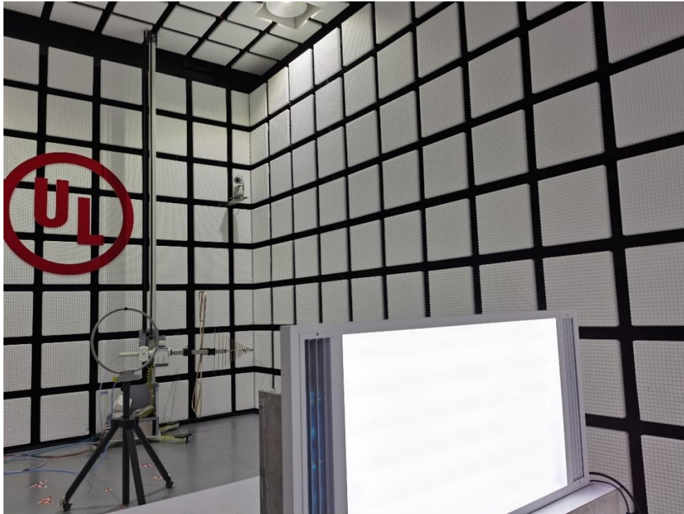
Radiated Disturbance above 1GHz