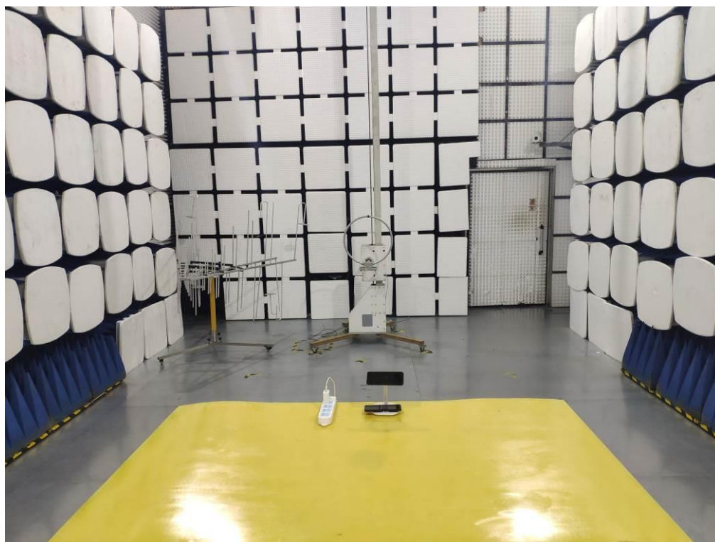
Radiated Emission below 30MHz